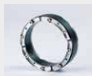
e.g. HSD 200/159