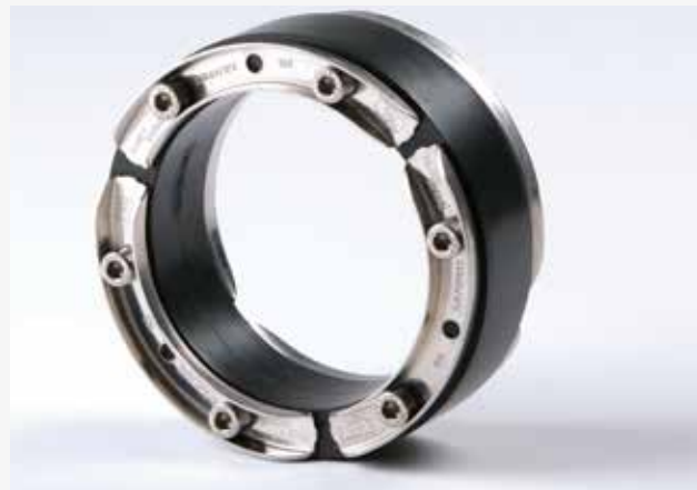
P-PIPE Basic 1

With 8 seal sizes and 3 seal widths, the most common pipe sizes from 32 mm up to 450 mm and the most important loading conditions can be sealed.