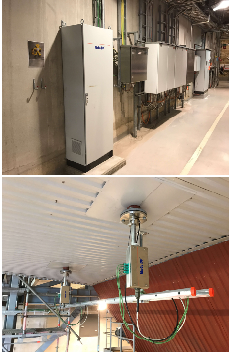
MoCo DP main unit and lower picture MoCo DP probes installed in flue gas canal.