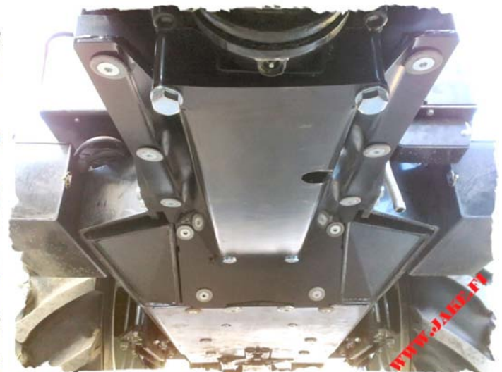
With JAKE Engine Armour