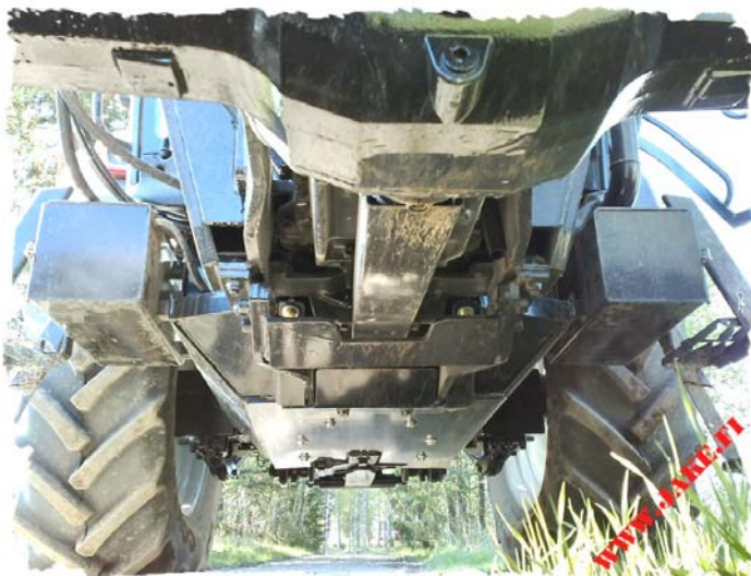
Without JAKE Engine Armour

The original Valtra fuel meter shows correct level of fuel in the JAKE Forest Tank , too. The JAKE Forest Tank delivery includes new ladders designed especially for a forest use. The JAKE Forest Tank is also available for a tractor with a front loader, a front linkage, cabin suspension, front axle suspension and a compressed air unit. A flat bottom shape and full cabin basis protection provided by the JAKE Forest Tank can be completed with a JAKE Engine Armour and a JAKE Rear Armour .