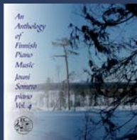
Vol. 4 FCRCD-9718