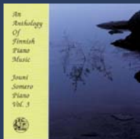
Vol. 3 FCRCD-9717