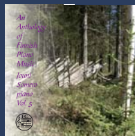
Vol. 5 FCRCD-9722