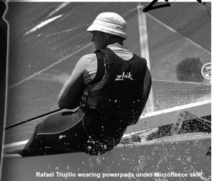
Rafael Trujillo wearing powerpads under Microfleece skiff

The new patented PowerPad system from Zhik has reinvented hiking forever. Stick inPlace, Strong Durable and Comfortable, No more tight and clunky hikers.