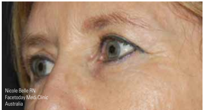
AFTER 3 TREATMENTS WITH RegenACR Plus