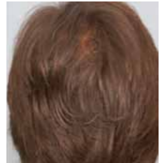
AFTER 3 TREATMENTS WITH RegenACR classic & Extra