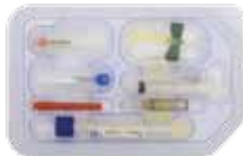
RegenACR Extra & Classic