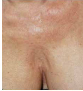
AFTER 3 TREATMENTS WITH RegenACR Plus

Injections of RegenPlasma® (Autologous Platelet-Rich Plasma) into the dermis support, accelerate and increase the tissue regeneration process. It activates the tissue regeneration process by stimulation of new collagens production (Type I, III, IV), the induction of mesenchymal stem cells division, differentiation and the stimulation of angiogenesis.