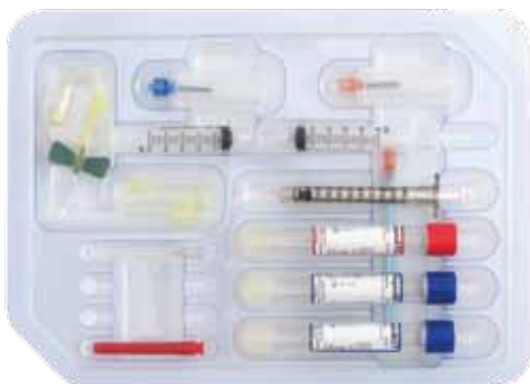
RegenACR Plus CE 0123

WARNING: Due to the risk for the vessels, avoid eye lids, be cautious on the glabella area, no injection in the internal eye's angle.