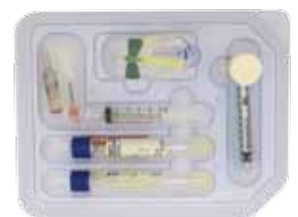
RegenACR Extra CE 0123