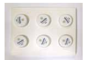
RegenACR Cellular Mask Advanced