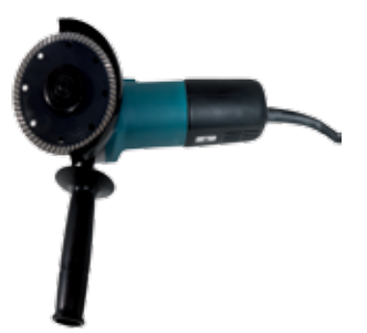
Angle grinder + smooth diamond disc. For any format.