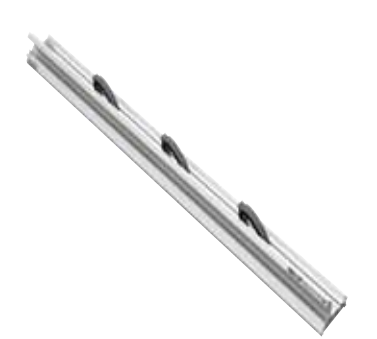
Raimondi cutting guide. For any format. Recommended for large formats up 150 x 300 cm / 59,05" x 118,11".