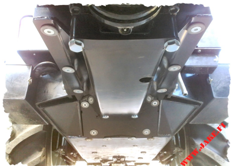
With JAKE Engine Armour