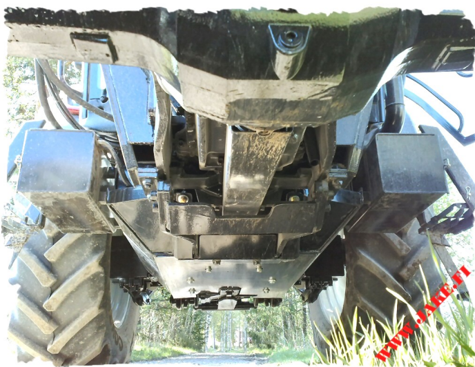
Without JAKE Engine Armour