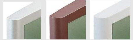
3 casing colours: aluminium, burgundy, white