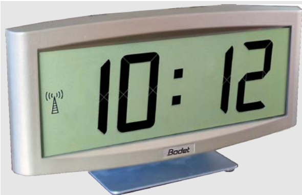
Cristalys 7 on table support