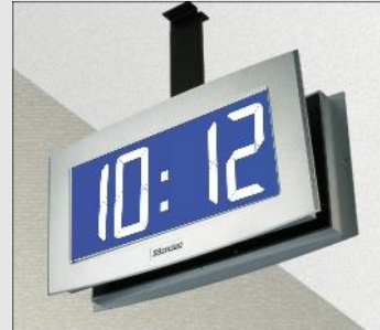
On double sided bracket