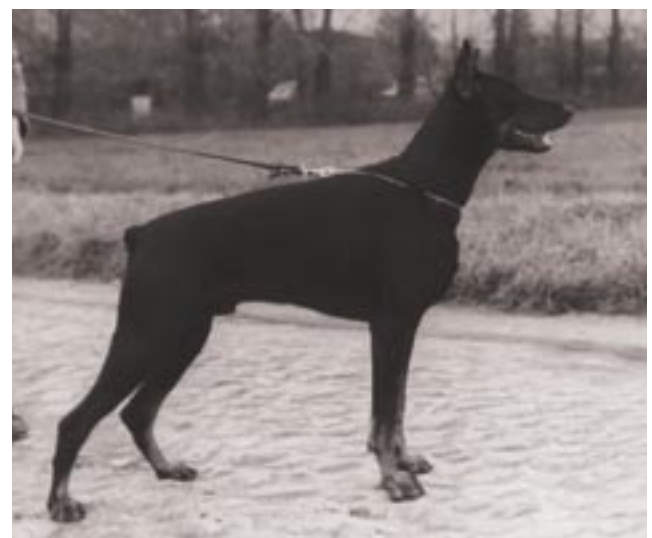
Ilg v. Amtmannsgarten , born 1985; an elegant but oversized black male dog, strongly inbred from West German breeding, with death by heart failure (Father: Jason von Nymphenburg.)