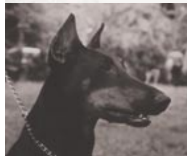
Asta v.d. Dobermannstadt, Best bitch in Show Biesdorf 1984, Dam of Dobermannstadt E litter. Asta was free of DCM in phenotype and genotype