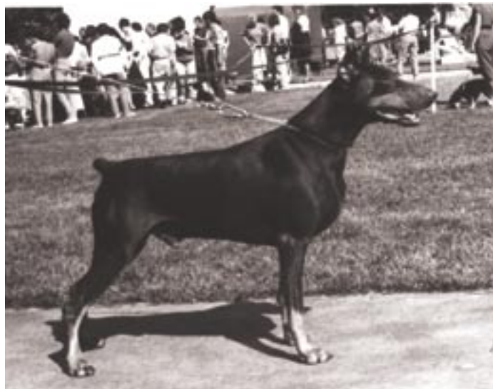
A robust brown male dog from Russian breeding, a very powerful type without inbreeding and without West European ancestors. This photo from the Haberzettl archives was made in 1988 at an International Dog Show in Budapest, Hungary.

In 1990, he served as Breed Warden for the East German Dobermann Verein, the same year that the East and West German Dobermann Verein were reunited. He bred Dobermans from 1970 until about 1990. At the present time he is an active member of the SV and is an ardent breeder of German Shepherd Dogs