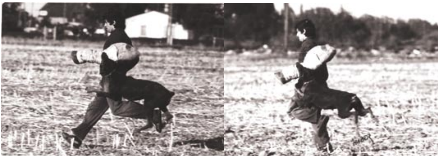
The brown Doberman bitch Freya vom Kohnstein SchHI (born 1969) biting while stopping the helper from fleeing in 1975 in two escape phases. The quickness and high temperament of good Dobermans place severe demands on the helpers' abilities.  made at a training day in 1975 in Magdeburg, East Germany.

The Doberman was created from mixtures of various breeds and half-breeds at the end of the 19th century (Göller 1912, Dom 1957). This genetic variety (Heterozygosity) was a great health advantage. Up to approximately 1950, there were practically no hereditary health problems, worldwide. The Doberman was vigorous and long-lived. These qualities still remained in the populations of East Germany and Eastern Europe up to the nineties.