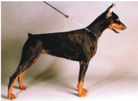
Nicole v. Norden Stamm