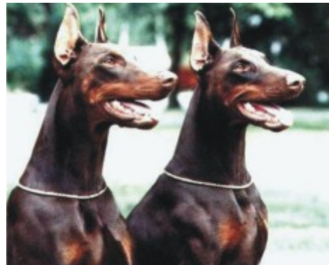
Kalina & Mia v. Norden Stamm

English horse breeders have a saying: Breed the best to the best ... and hope for the best! The truth is, there isn't a male in the world that can "fix" all the problems a bitch might bring into the "wedding", so following the English saying, it goes to say that a brood bitch must be as good as the stud dog if you are to expect fair odds.