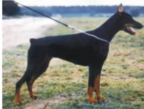
Tiffany v. Norden Stamm

harmonious and basically correctly built and proven beyond doubt that they had a character to match their conformation. Before picking a stud dog for a bitch I decided to breed, I "ruthlessly" try to pick her apart and list all her virtues and the points I'd like to improve on.