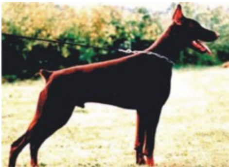
Rembrandt v. Norden Stamm

Ebo v.d. Groote Maat, Baron Bryan Harrosberg, Quinn dei Nobili Nati, Eick v.d.Rappenau are some stud dogs you have used. What made you choose these stud dogs? You have a huge 40 years of experience, during which you've bred some 65 litters.