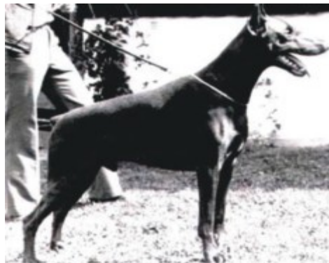
Guys Hilo v. Norden Stamm

"fair". Without meaning to be arrogant in any way: There were so many beautiful and exotic dogs to pick from and to mention one above the other, either from my own breeding or from other breeders' stock, would not be "fair". Each generation had its own crop of excellent specimens, but should I (nostalgically?) pick out one "all time favourite", it would have to be Zarina v. Nordenstamm ... a result of a brother/sister mating between Hilo & Heidi v. Norden Stamm in 1975. A male I greatly admired was Eick v.d. Rappenu.