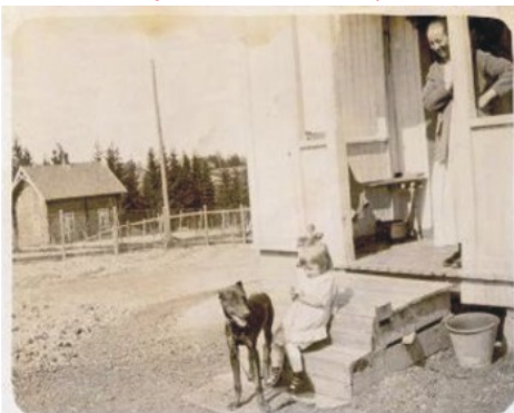
Picture from Album Family 1923

My first dog was a German Shepherd Dog but living in a flat made a long coated dog rather "impractical" in the household. My next dog was therefore a Dobermann. He was not very attractive to look at but he had a good character. I later bought a bitch, which turned out to be rather good looking but with a poor character. I later gave away both dogs. Visiting the first DV Siegershow in Wuerzburg in 1969 was an eye opener in many ways. I remember very well the winner, a 15-month-old black male named Chico v. Forell.