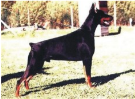
Ninjo v Norden Stamm