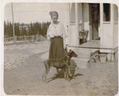
Picture from Album Family 1923