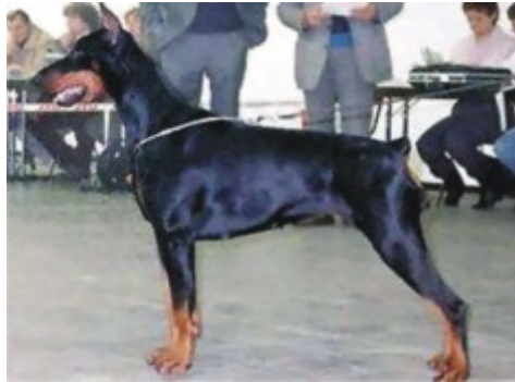
Alida v Fl. Loowen