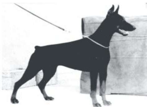
Zarina v. Norden Stamm

Without meaning to be arrogant in any way: There were so many beautiful and exotic dogs to pick from and to mention one above the other, either from my own breeding or from other breeders' stock, would not be