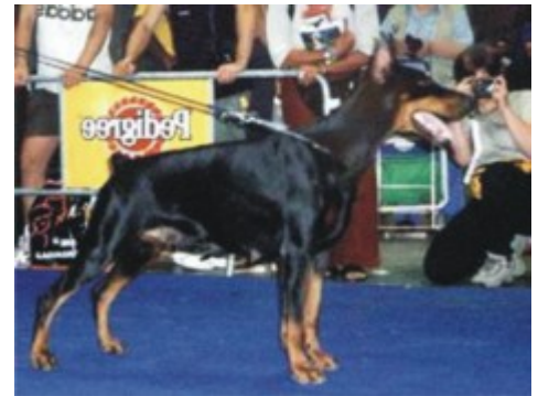
Come as You Are Alabama