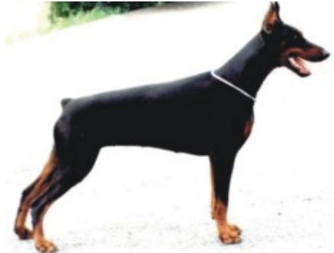
Gilda v. Norden Stamm