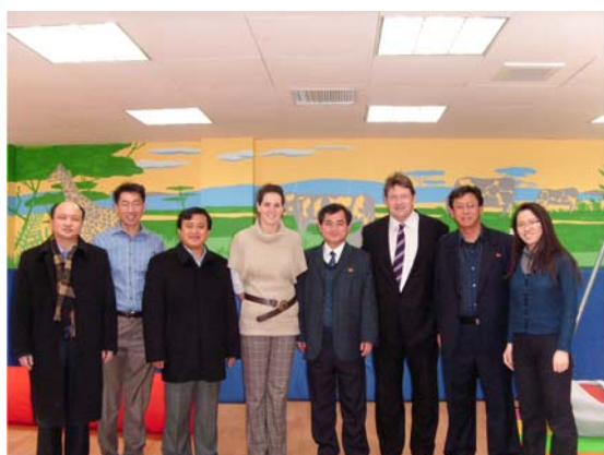
KFPD Mission with staffs of "Save the Children"

The contents of homepage will be renewed once a quarter. Homepage "Hope" will be opened on June, 18 th when the Law of the DPRK on the