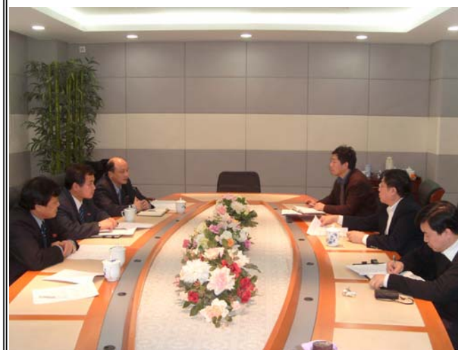
KFPD Mission discusses with CDPF on the adoption of the MoU

On February 9 th , 2010, in Beijing, the Memorandum of Understanding on cooperation between the Central Committee of Korean Federation for Protection of the Disabled (KFPD) and China Disabled Persons' Federation (CDPF) was adopted.