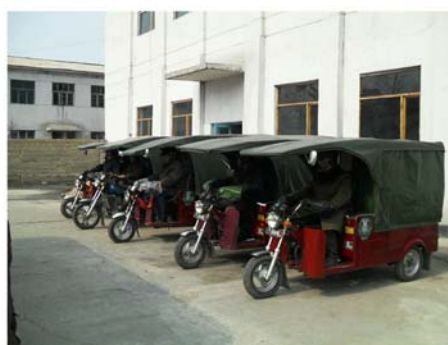
Provision of motorcycles for the amputees in Wonsan City