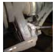
4. Insert it