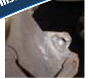
1. Stripped Thread