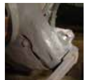
5. New Thread