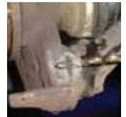
2. Drill it