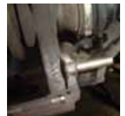
6. With bolt