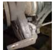
3. Tap it