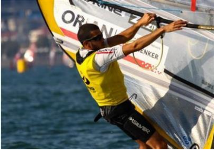
Sports channel, Online magazine

“The life of a professional sportsman involves injuries. The device shows good results, it’s always in the bag, anywhere in the world. It’s very available, simple and efficient”