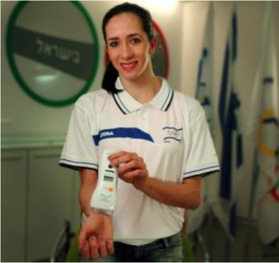
Shvoong, Online magazine

“I am using the device for several months, I’ve had injuries and the device really helps ... it recuperates the pain area in cases of injuries from intense training and inflammations.”