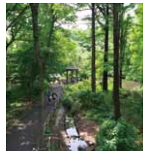
Bald cypress forest

Wild grasses ● Plants not usually found on the forest floor grow here. Communities of plants such as large Periwinkle and jumpseed as well as Japanese fairy bells and carpet bugles can be seen.