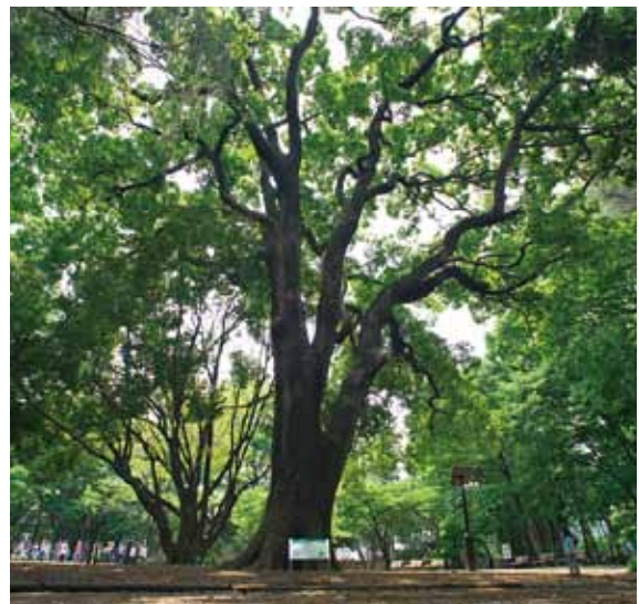
Overwhelming camphor tree

Giant trees ● With the site's history spanning more than a hundred years, there are many trees with trunk circumferences of more than three meters. Those include Japanese zelkovas, camphors, poplars, and buttonballs that form a tall skyline. Of those, the big camphor in the grass field presents an overwhelming display and is the symbol of the park.